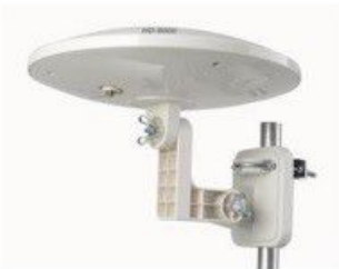
Mast Pipe Mount

The omnidirectional antenna can be mounted to a mast pipe or a flat surface of any angle. Both the bracket angle and the antenna angle are easily adjustable. Antenna width 15 inches