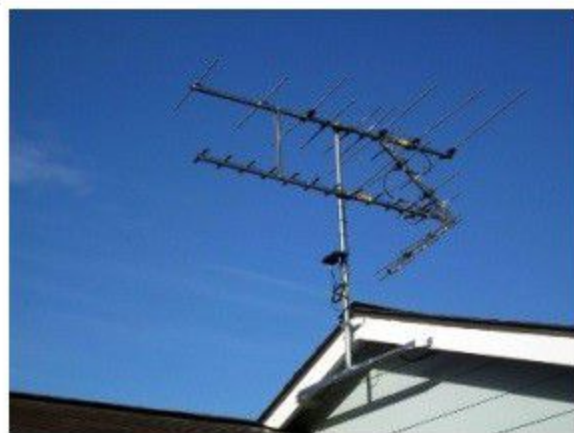
Outdoor TV Antenna Larger Image

Eave mount, mast pipe and preamplifier shown not included.