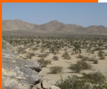
Saddleback Butte State Park