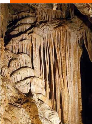
Providence Mountains State Recreation Area