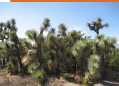
Arthur B. Ripley Desert Woodland State Park