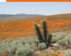
Antelope Valley California Poppy Reserve

California State Parks Non-Profit Cooperating Association