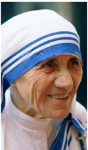
SAINT MOTHER TERESA

St. Barbara and St. Theresa Churches have been unified under the parish name of St. Mother Teresa of Calcutta.