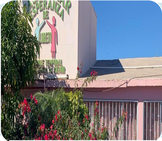
Group Foster Care Home in Loreto