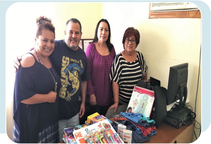
Donations for the children