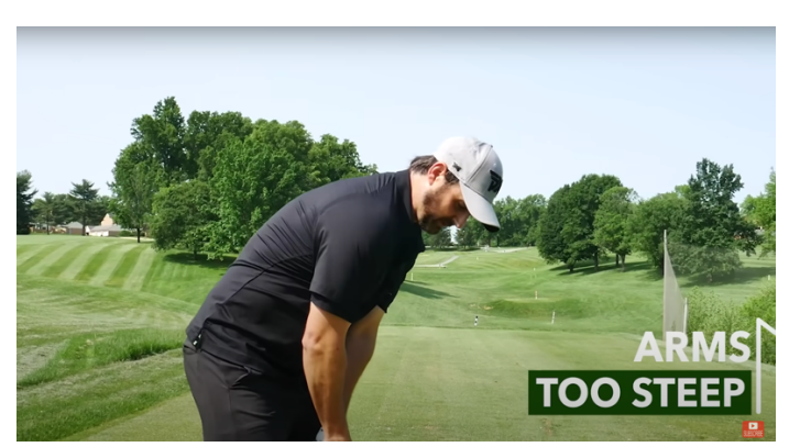
Your downswing becomes too steep

3. With no arm structure, what happens to your downswing?