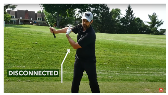
Your arm gets disconnected

2. What happens when you setup with no arm structure?