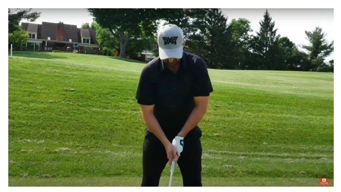
There is no structure in the arms which will cause the arms to bow out

1. What is wrong with the setup in the picture below?