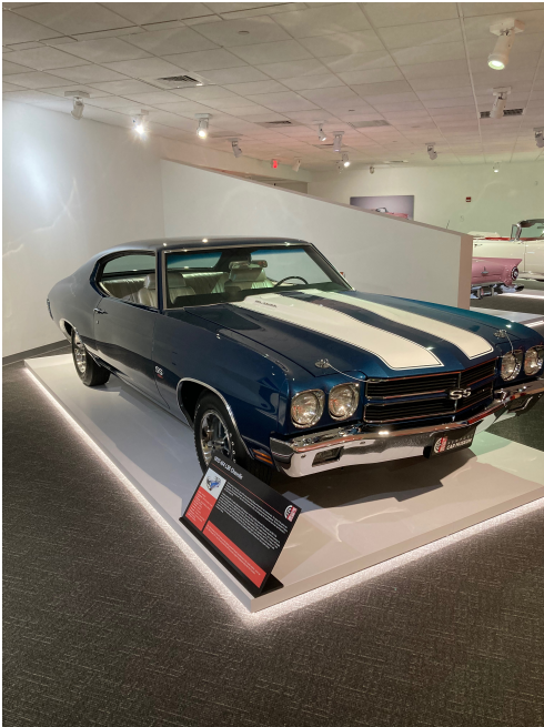
1970 Chevelle SS