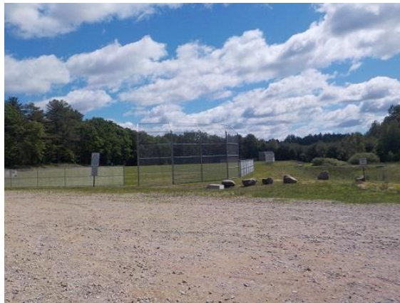
Marston June 2022