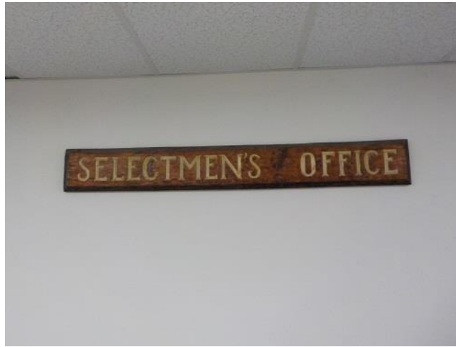
Sign in the Select Board's Office

TA White added the State suit against 3 M Corporation is ongoing and the State is looking into ways to defray the towns 'documentation costs in this legal action. The town may soon buy a utility truck for $75,000.