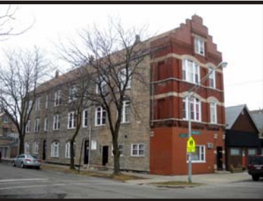
9-Unit Apartment Complex on South Wolcott Avenue

8,294 SF Industrial Condo • Zoned I-1 • Loading Dock • 24' Ceilings • Temp. Controlled • Clear Span • Sprinkler Fire-Suppression System • NO RESERVE! 1340 Ensell Road, Lake Zurich, IL 60047