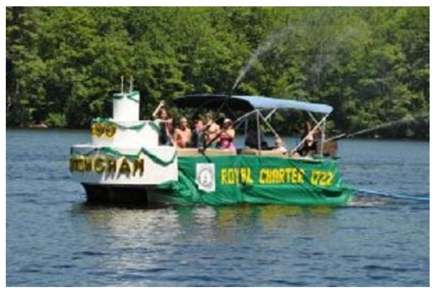
A pontoon boat celebrating Nottingham's 300<sup>th</sup> from the July 4<sup>th</sup> boat parade on Pawtuckaway Lake. The pontoon coats offering the tour will not so 300<sup>th</sup> decorated.

See you at the picnic and on the lake!!:-)