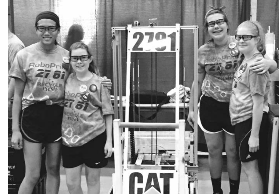
The RoboPride Robitcs team at Queen of Peace High School, 77th & Linder will sponsor an Aquabotics Party on Friday, Aug. 26th from 4 to 7 p.m. Festivities include food, a 100 ft. slip and slide, water balloon toss, kickball tournament and more. The team has six weeks to create an industrial size robot that is programmed to play a specified field game. Funds are being raised to participate in additional competitions and purchase tools. Advance sale tickets are $10 (13 years old and older) or $5 (under the age of 14). Tickets at the door are $12. For more information, visit www.queenofpeacehs.org/aquabotics-party.