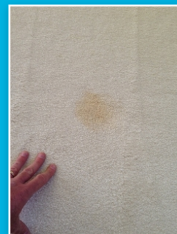
Permanent color loss from alkaline urine salts