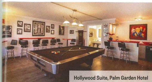
Hollywood Suite, Palm Garden Hotel

Celebrating in the Conejo Valley is easy. Music lovers enjoy the Thousand Oaks Civic Arts Plaza, a world-class concert venue and The Canyon Club in Agoura Hills "Where Music Meets the Soul". While you're there, visit the Whizin Market Square for shopping & dining: