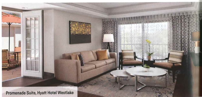
Promenade Suite, Hyatt Hotel Westlake

Hyatt Regency 880 S. Westlake Blvd., Westlake Village www.hyattregencywestlake.com