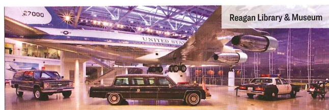
Reagan Library & Museum

40 Presidential Dr., Simi Valley www.reaganfoundation.org