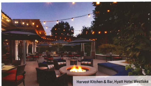
Harvest Kitchen & Bar, Hyatt Hotel Westlake

Conejo means “rabbit” in Spanish & refers to the rabbits common to the region. Originally, the native Chumash Indians were the first residents, then in 1803, the Spanish land grant in the area was given the name Rancho El Conejo. Now, the Conejo Valley hosts numerous recreational activities for hikers, music fans, wine & dine aficionados, history buffs and families all seeking to celebrate the fullness that life has to offer.