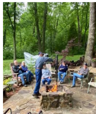
Saturday Get Together