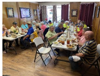
Day Ride to D's Specialty - Stroud