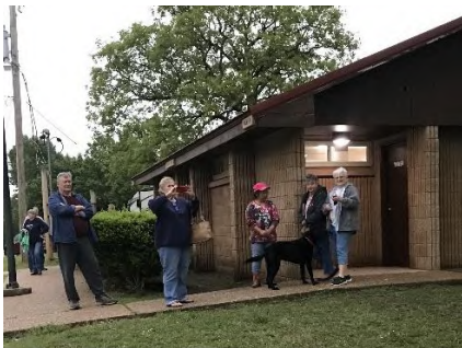
Riding out Tornado Warning @ Heyburn