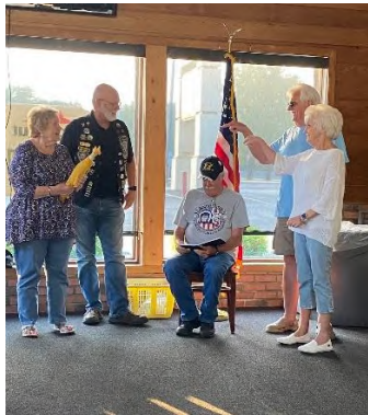
"Chicken Court" @ Gathering