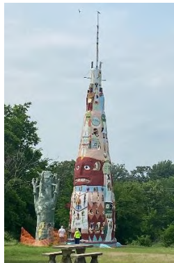
Totem Pole Park Picnic