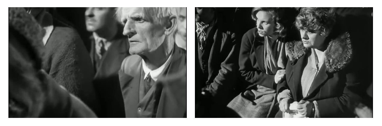
(For a moment, it looks like Beckert's monologue during his 'trial' touches a cord with the audience of the kangaroo court)

(Schränker presiding over the kangaroo court—the demagogue displays the ease with which a criminal could become one with the state)