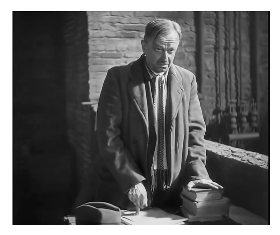
(Beckert's defender at the kangaroo court—played by the essayist Rudolf Blümner—is mocked by the criminals but emerges as a voice of justice)

<sup>1</sup> Mark Felton Productions. "German 'Giant' Over London: The Zeppelin-Staaken R.VI, 1917-18".