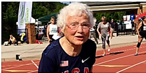
Julia "Hurricane" Hawkins

By Amanda Lindsley | June 19, 2019 at 6:37 AM CDT - Updated June 19 at 8:32 AM