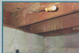
Floor Structure Damage

Our reports include digital photos, line drawings and color coded narratives.