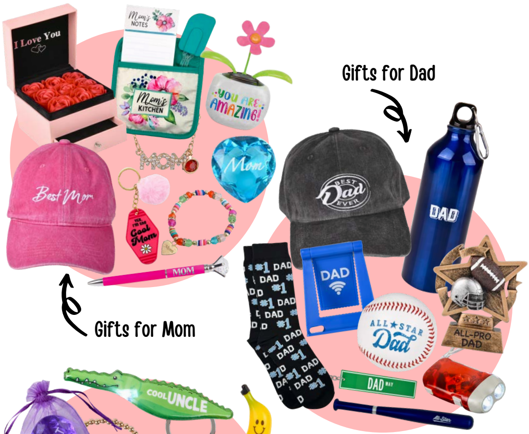
Gifts for Dad