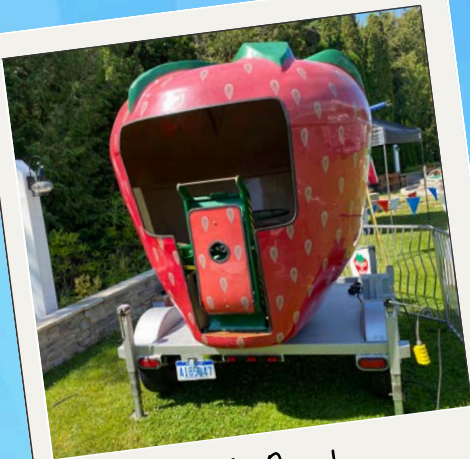
Berry Go Round