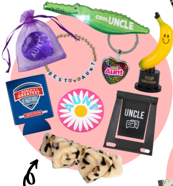
Gifts for Aunt & Uncle