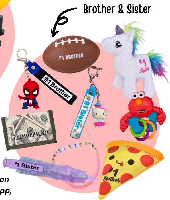
Brother & Sister